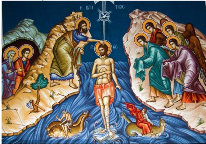
January 6: The Theophany of Our Lord