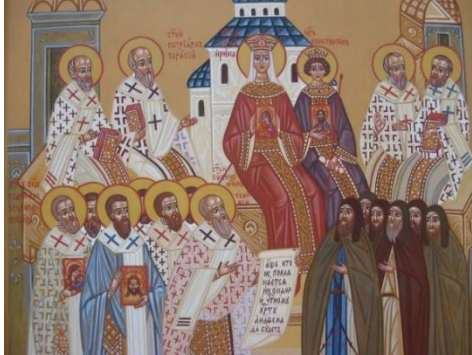
The Fathers of the Seventh Ecumenical Council –Nicaea in 787 AD