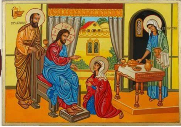
Jesus said to Martha, "Mary has chosen the better part and it will not be taken from her." –Luke 10:42