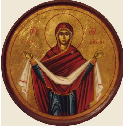
Protection of the Theotokos